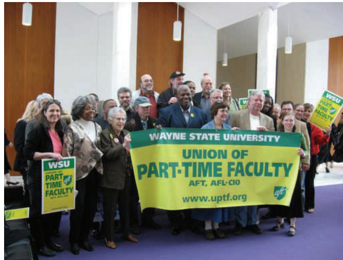
UPTF members gather at the April 30 Board of Governors meeting, just hours after reaching a tentative agreement with the administration.